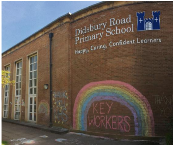
A beautiful rainbow of hope outside Didsbury Road Primary school.