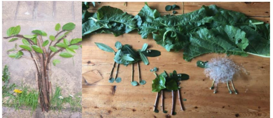
Some beautiful land art by pupils at Romiley Primary School.