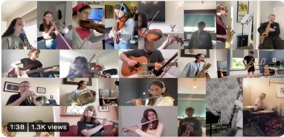
Take a listen to Bramhall High School's Virtual Orchestra, who have recently appeared on ITVs Granada reports.