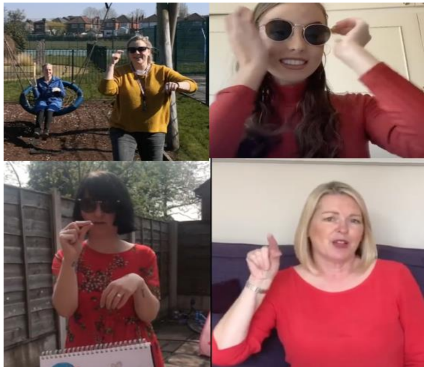
Watch the fantastic lip-sync and signing films on YouTube created by the talented Heaton's School team.

We will be sending out the next Relational Round Up letter in the week beginning June 22 nd . If you would like to share a good story or show us something that you have been creating at home in our letter please tweet to @stockportRA